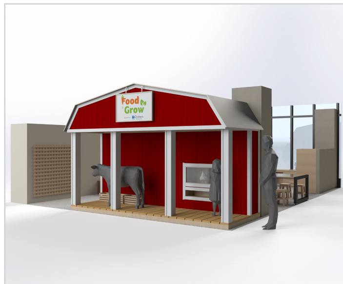
Table - Enjoy a delicious and nutritious meal of your making around the Table with family and friends!

Kitchen - Prepare a meal with a diverse variety of ingredients in the Kitchen. Take a look at the recipe book to learn about different meals and the array of ingredients used to make them.