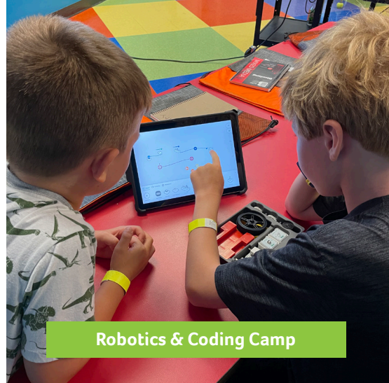
Robotics & Coding Camp