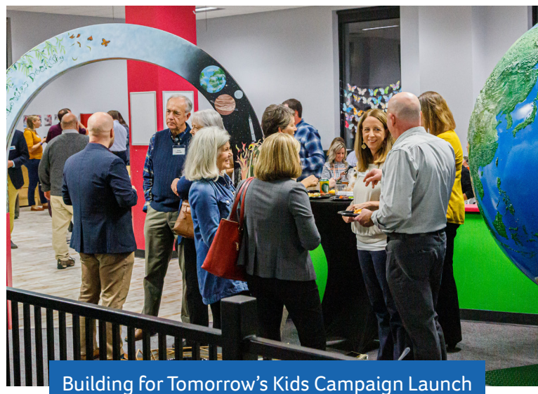
Building for Tomorrow's Kids Campaign Launch

We are looking forward to building off of last year's successes as we embark on an ambitious plan for 2023, including a new permanent exhibit in the museum. This new exhibit, called Food to Grow, will address a critical need identified by our community. The exhibit has a focus on food sourcing, food choice, food equity, and the overall cultural significance of food. Featuring a farm, market, pantry, kitchen, and family dinner table, Food to Grow will replace the BFK