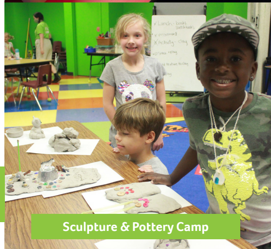
Sculpture & Pottery Camp