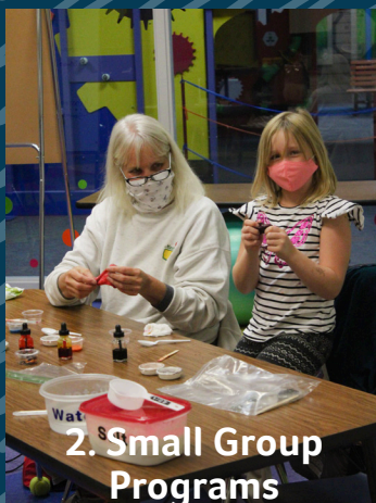
2. Small Group Programs