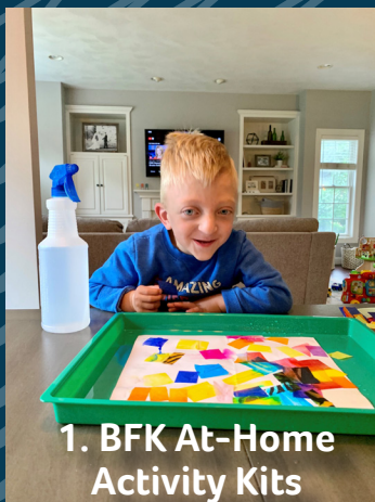
1. BFK At-Home Activity Kits