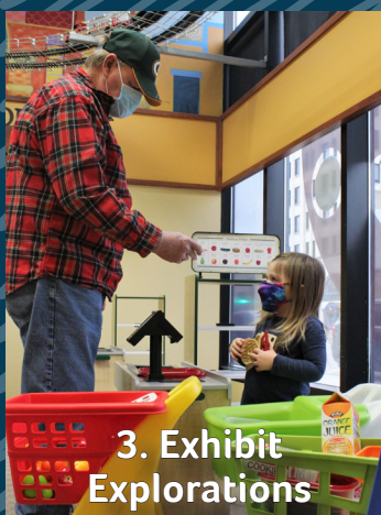
3. Exhibit Explorations

For more information on these opportunities, visit buildingforkids.org .