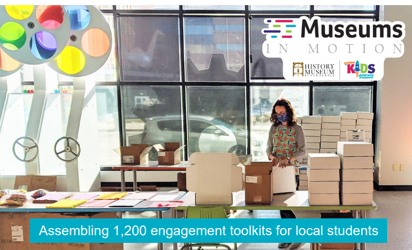
Assembling 1,200 engagement toolkits for local students