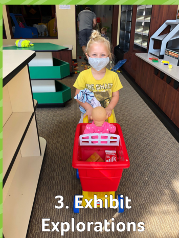
3. Exhibit Explorations

For more information on these opportunities, visit buildingforkids.org .