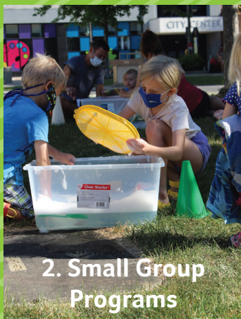
2. Small Group Programs