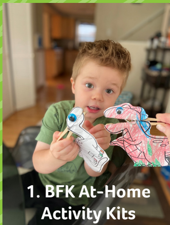
1. BFK At-Home Activity Kits